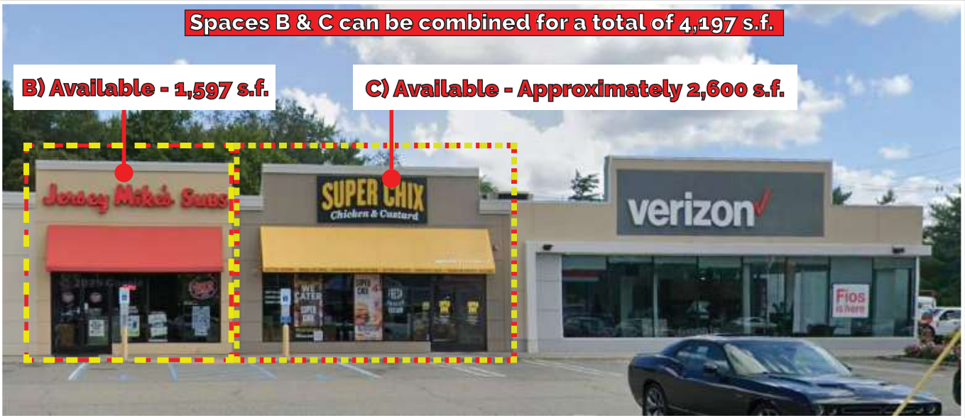
Spaces B & C can be combined for a total of 4,197 s.f.