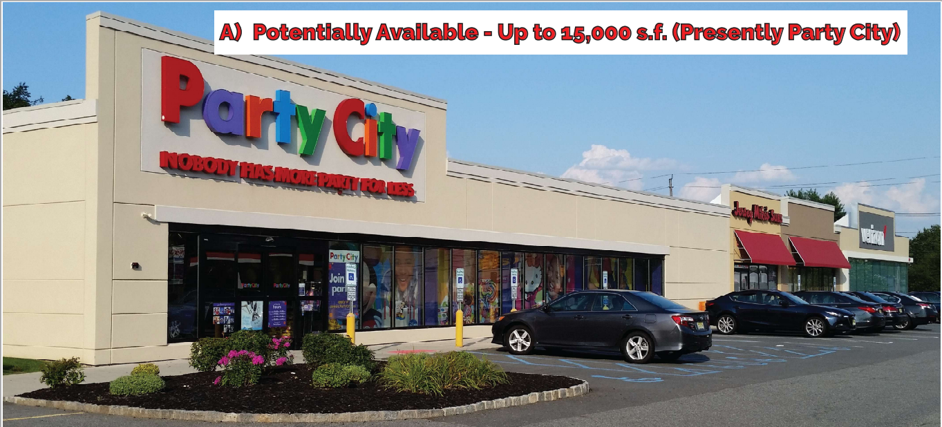
A) Potentially Available - Up to 15,000 s.f. (Presently Party City)

Potentially Available - Up to 15,000 s.f.