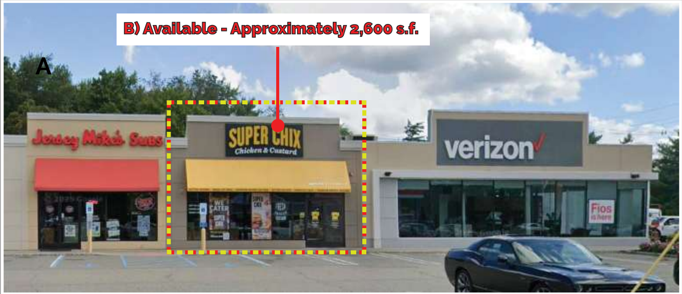
B) Available - Approximately 2,600 s.f.