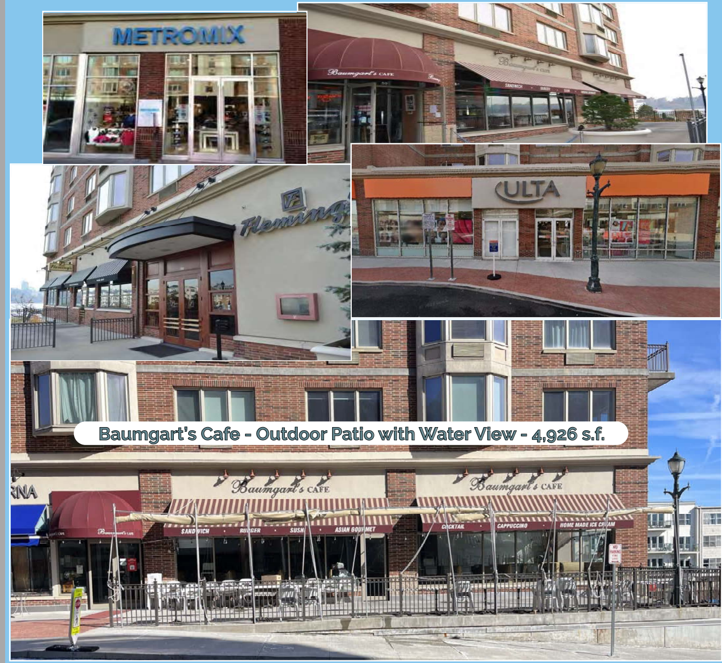
Baumgart's Cafe - Outdoor Patio with Water View - 4,926 s.f.

AVAILABLE: 4,926 s.f. - Presently Baumgart's Cafe - Outdoor patio with water view. Other Available Spaces: 952 s.f. / 2,891 s.f. / 3,417 s.f. Co-Tenants: Gap, Banana Republic, Ann Taylor Loft, Victoria's Secret, Ulta Cosmetics, Tommy's Tavern, Guess, Sleepy's, Chico's, Panera Bread, Carter's, Chipotle Mexican Grill, Express, Vitamin Shoppe, Bath & Body Works, Lenscrafters, Metromix, Fleming's Steakhouse, BareBurger, Mika Collections, & Alain & Co. Jewelers.