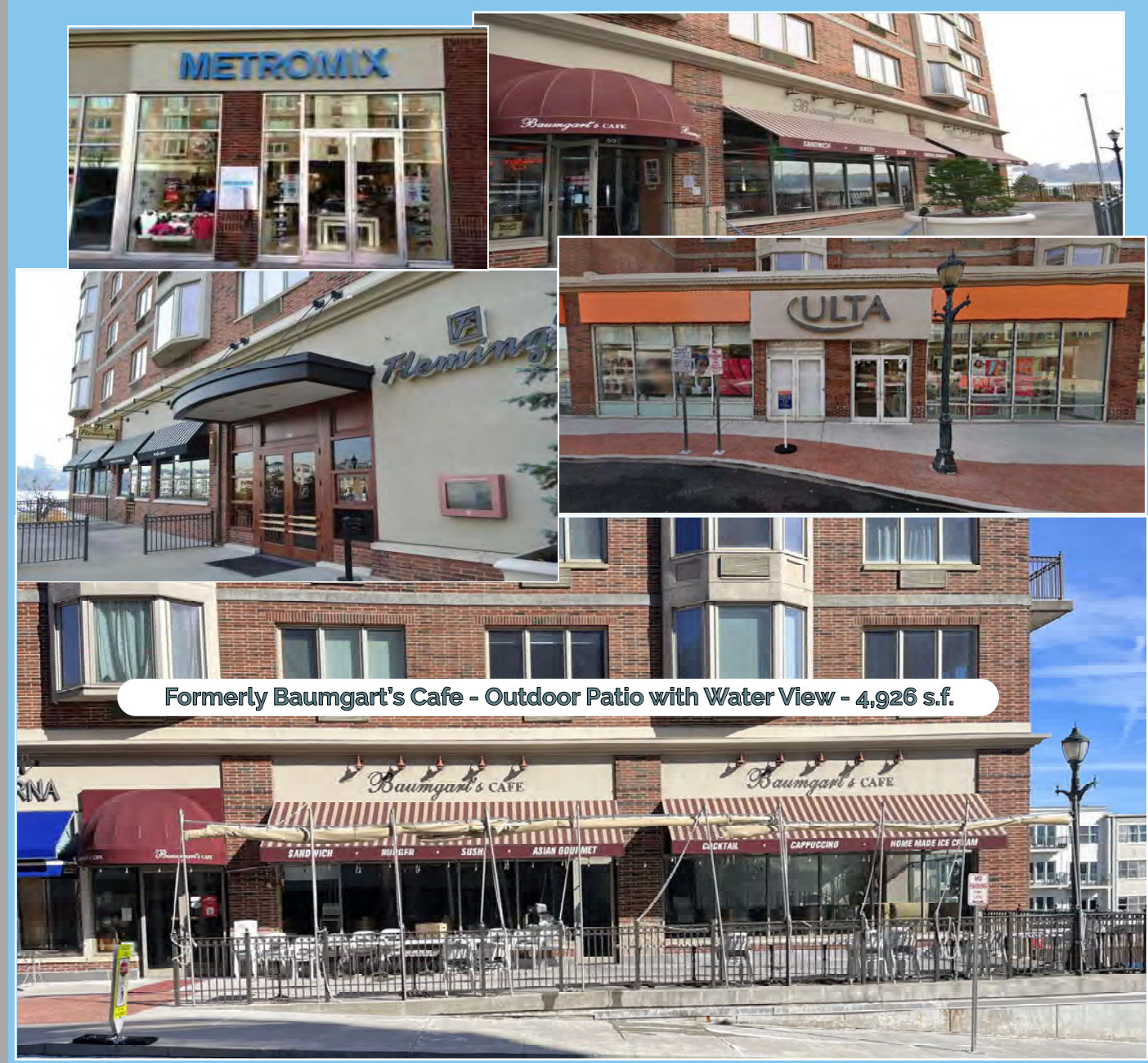
Formerly Baumgart's Cafe - Outdoor Patio with Water View - 4,926 s.f.

AVAILABLE: 3,417 s.f & 4,926 s.f. - Formerly Baumgart's Cafe - Outdoor patio with water view.