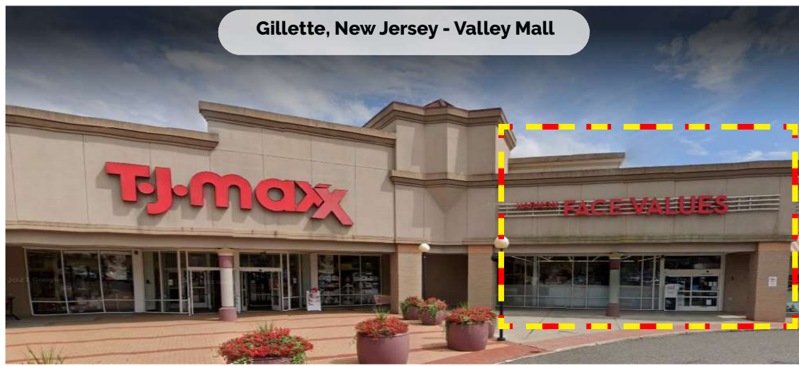
Gillette, New Jersey - Valley Mall