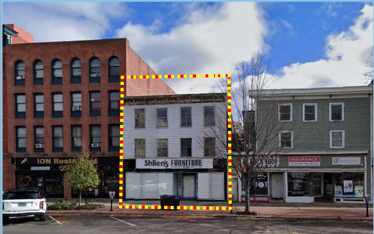
FORMER SHLEIN'S FURNITURE STORE - 3,304 S.F.