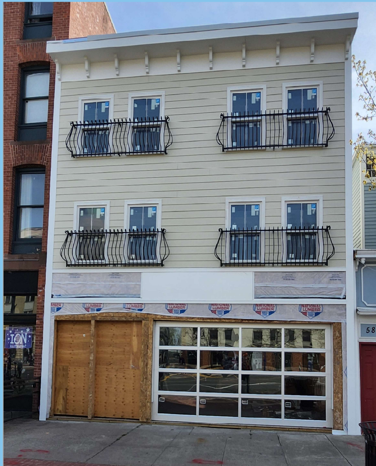
FORMER SHLEIN'S FURNITURE STORE - 3,304 S.F.

Middletown is a vibrant, diverse community, and they pride themselves on how much they have to offer to visitors and residents alike: great schools, a thriving economy strong neighborhoods, beautiful parks and open spaces, and an iconic downtown.