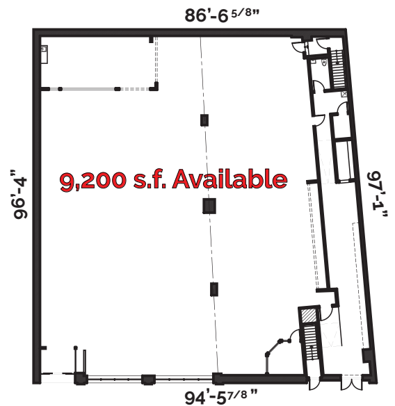
Existing Ground Floor Plan