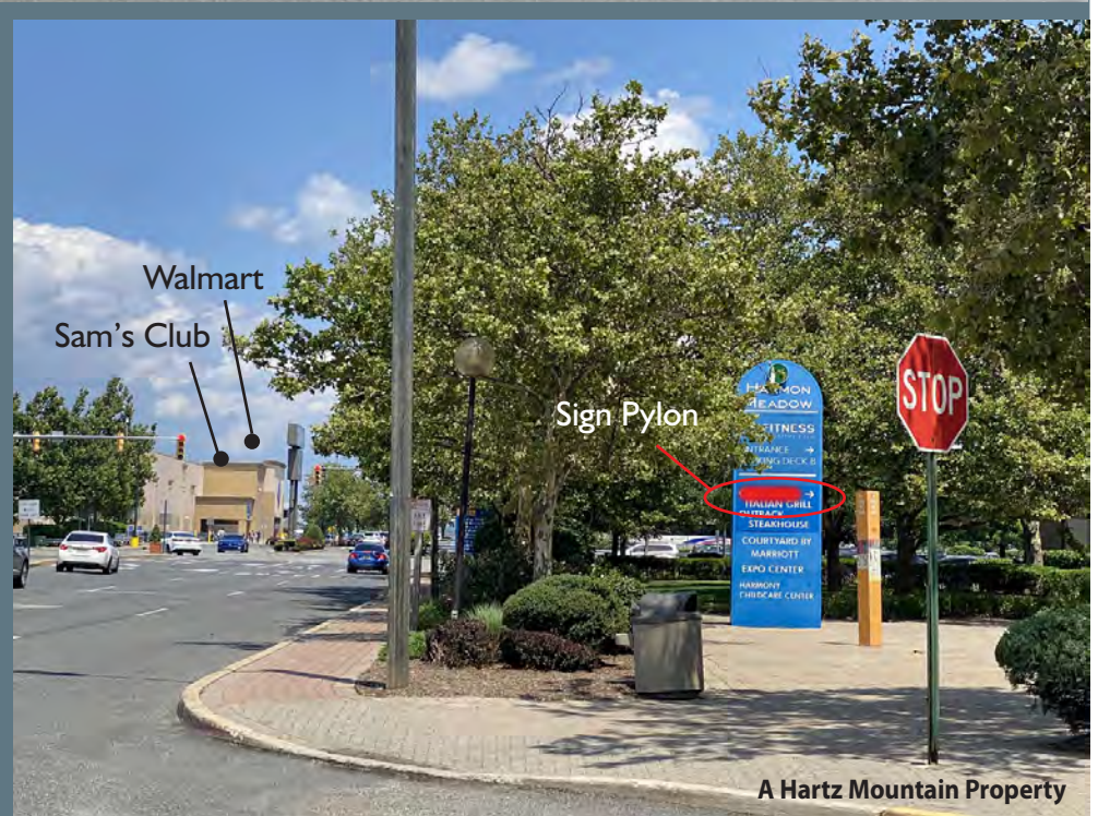
A Hartz Mountain Property

For leasing information, please contact: