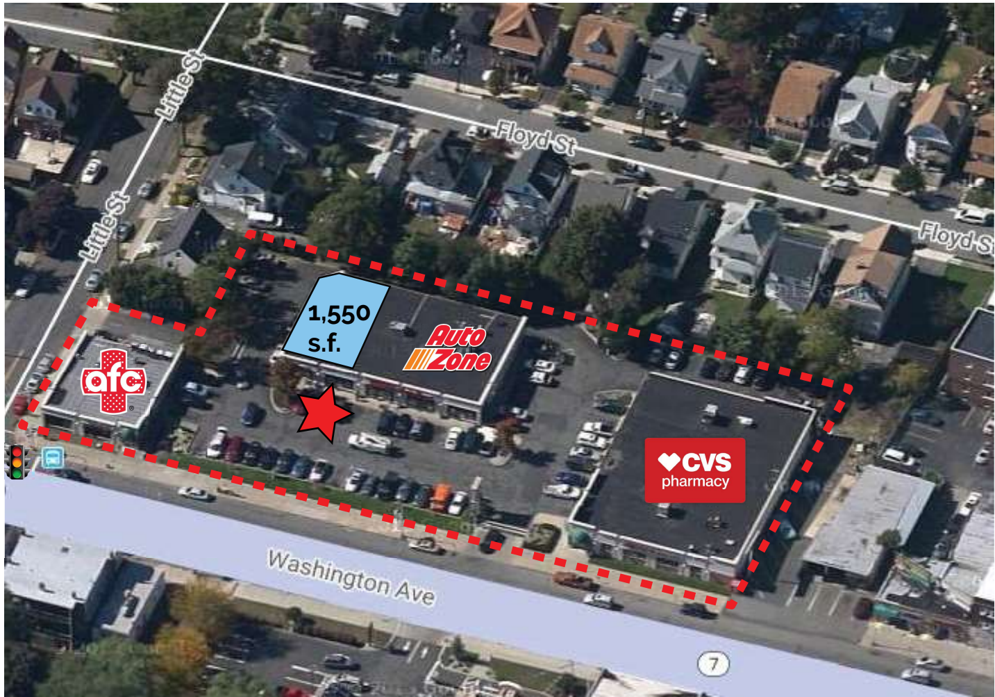
Located at the intersection of Washington Avenue & Little Road at a lighted intersection.