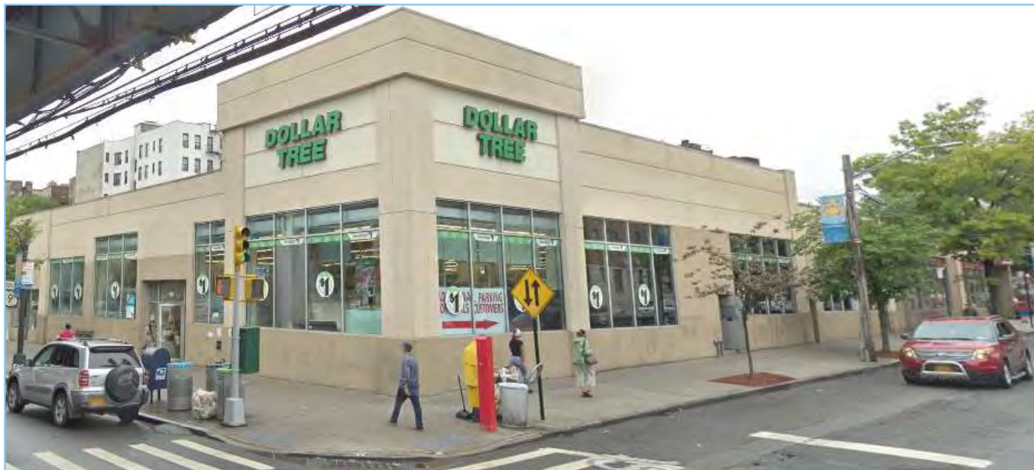
Located at the corner of 234th Street & Broadway at a lighted intersection.