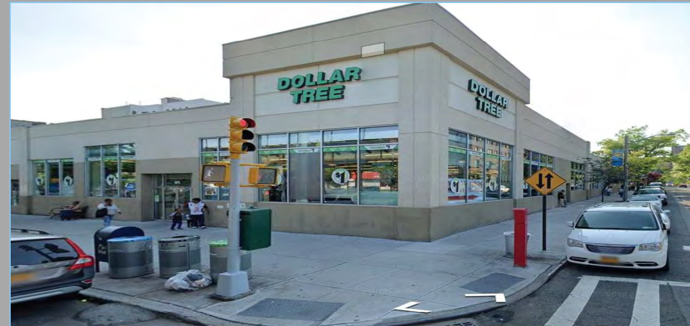
Available: 9,539 s.f. (presently Dollar Tree)

Corner location at a lighted intersection.