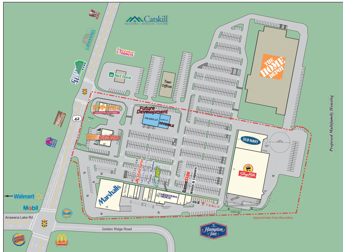
THOMPSON SQUARE 4388 Route 42 North | Sullivan County | Monticello, NY 12701